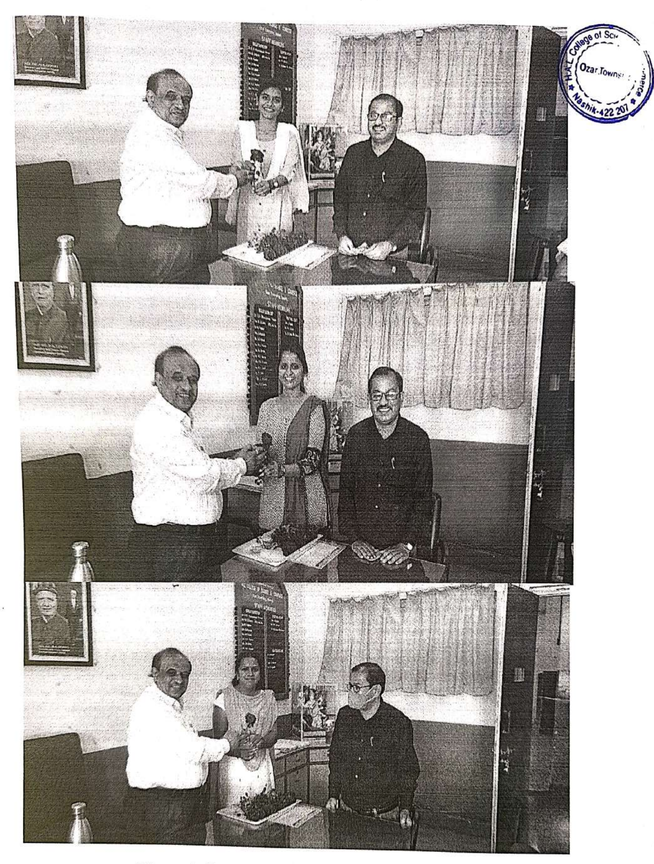
Women's Day Celebrated in college-2020-21

Incharge Principal H.A.L. College of Science & Commerce Ozar Township, Nashik-422 207.