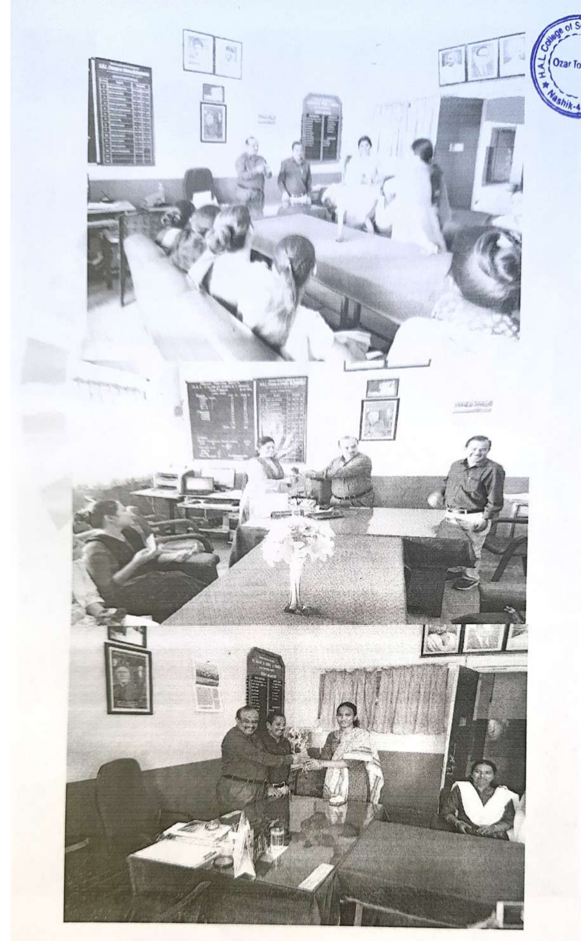
Women's Day Celebrated in college-2018-

Incharge Principal H.A.L. College of Science & Commel Ozar Township, Nashik-422 207