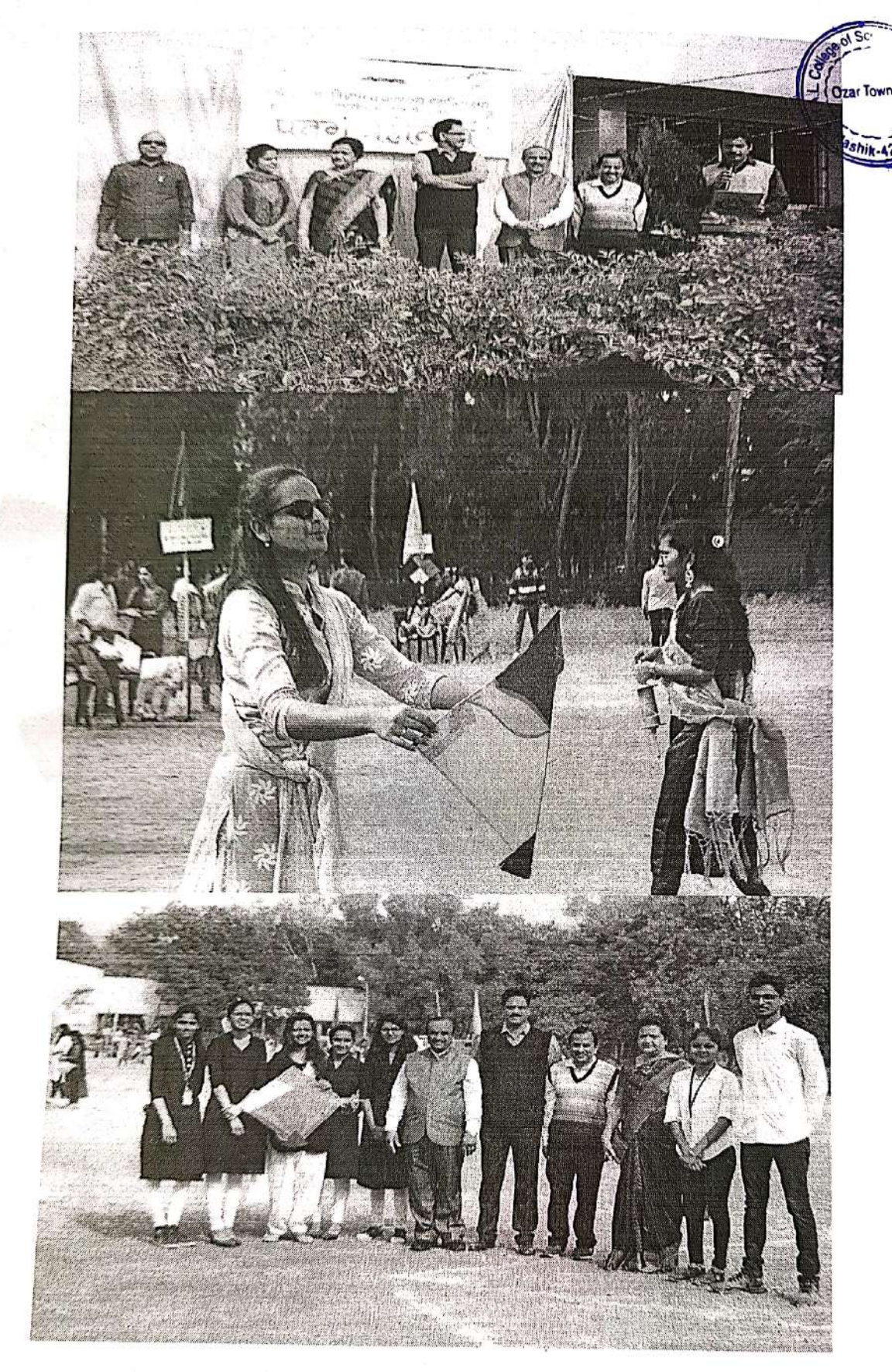
Our College has organized a Kite Festival ( PatangMahotsav 2020 ) under the Women Empowerment Program. Total participants from 13 colleges have participated in the same event.