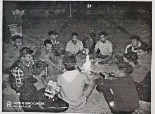
NSS CAMP FIRE