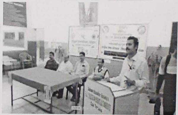
HAR GHAR TIRANGA