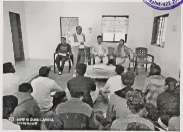
NSS SPECIAL CAMP AT SHIRWADE