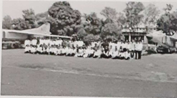
AIR FORCE VISIT