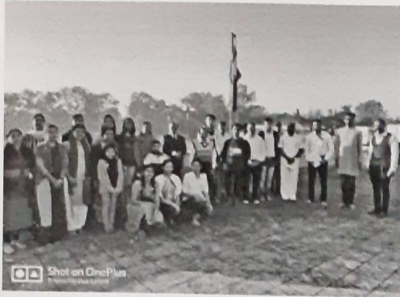
REPUBLIC DAY 2019