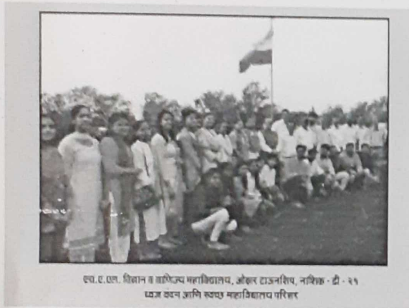
स्व. ए. ए. ल. विज्ञान व वाणिज्य महाविद्यालय, ओझर टाउनशिप, नाशिक - ४२२ २०७ स्वातंत्र्य दिन उत्सव महाविद्यालय परिसर